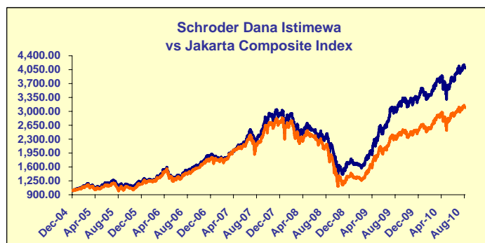
Legend: Schroder Dana Istimewa (Blue line), JCI (Orange line)