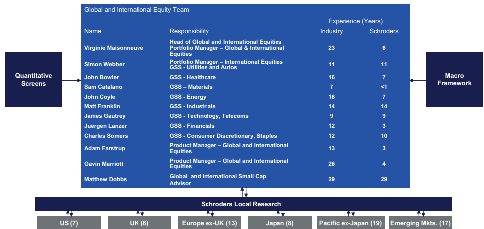
GSS is Global Sector Specialists