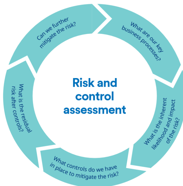
Risk and control assessment process

The risk and control assessment (RCA) process continues to be a key part of our risk management framework and is summarised in the diagram below. In 2018, we completed an upgrade of our technology to manage our operational risk framework, including RCAs, issues, events and data loss management.