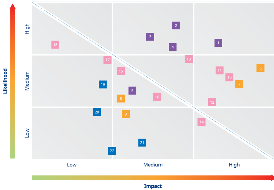
Risk impact matrix, based on residual risk assessment (after controls)

Details of how we manage our risks are described in the tables on the following pages.